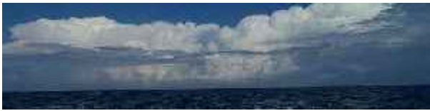
The Daybreak Page