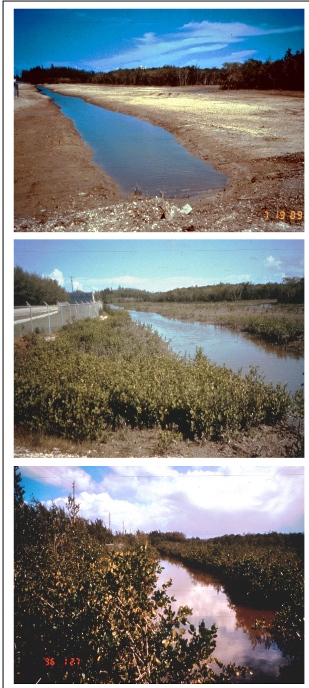
Figure 3. A time sequence over 78 months from the completion of hydrologic restoration at West Lake near Fort Lauderdale, Florida. Although no active planting was undertaken, all three Florida mangrove species became established

hydrologic restoration at a mangrove restoration site at West Lake near Fort Lauderdale, Florida. At this site, no active planting was undertaken but all three Florida mangrove species became established.