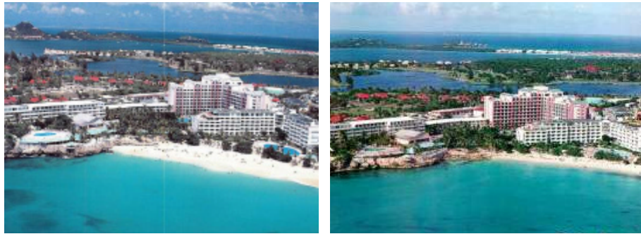
Figure 1 Previous wide beach (on left) and subsequent narrower beach (on right)