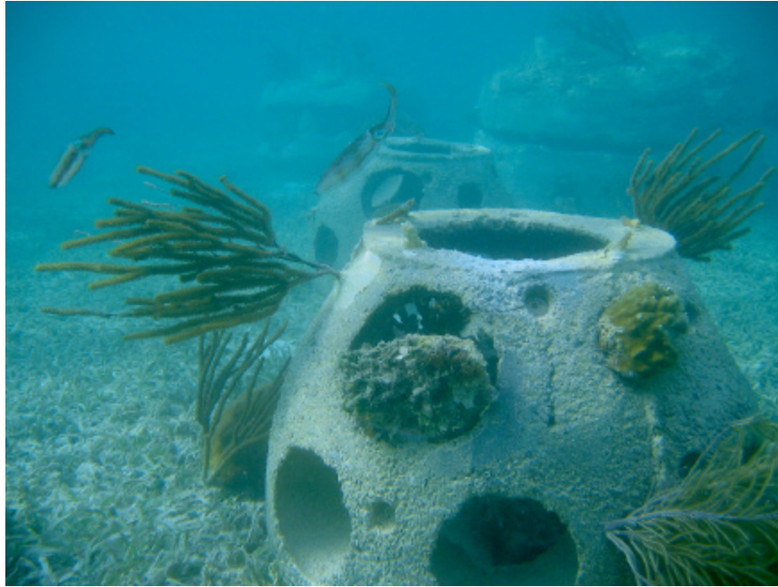
Figure 4 Reef Ball after coral transplanting.

transplanted will look like days after planting . In an effort to keep this section brief | detailed information concerning coral transplanting will be furnished upon request. | However, detailed—more information may be found at the following website | http://www.reefball.com/reefballcoalition/index.html .