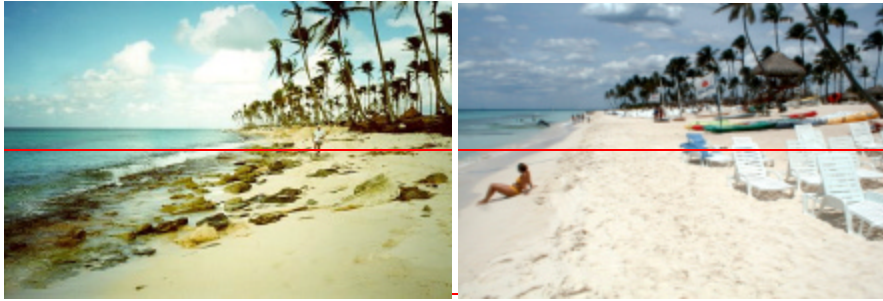
Figure 6 Before and after photos of the Dominican Republic project from 1998—2001.

Another very successful and important project is the one constructed off Maiden Island, Antigua. This project demonstrates all the different options including submerged breakwater, special anchoring techniques, coral transplanting, and snorkeling/diving trails using all the various sizes and specialized styles of Reef Balls. It is certainly our most ambitious project completed to date requiring 1200 Reef Balls with over 5000 live coral transplants and all completed in a record 2 months. Figure 7 shows an aerial photo of the Maiden Island project.