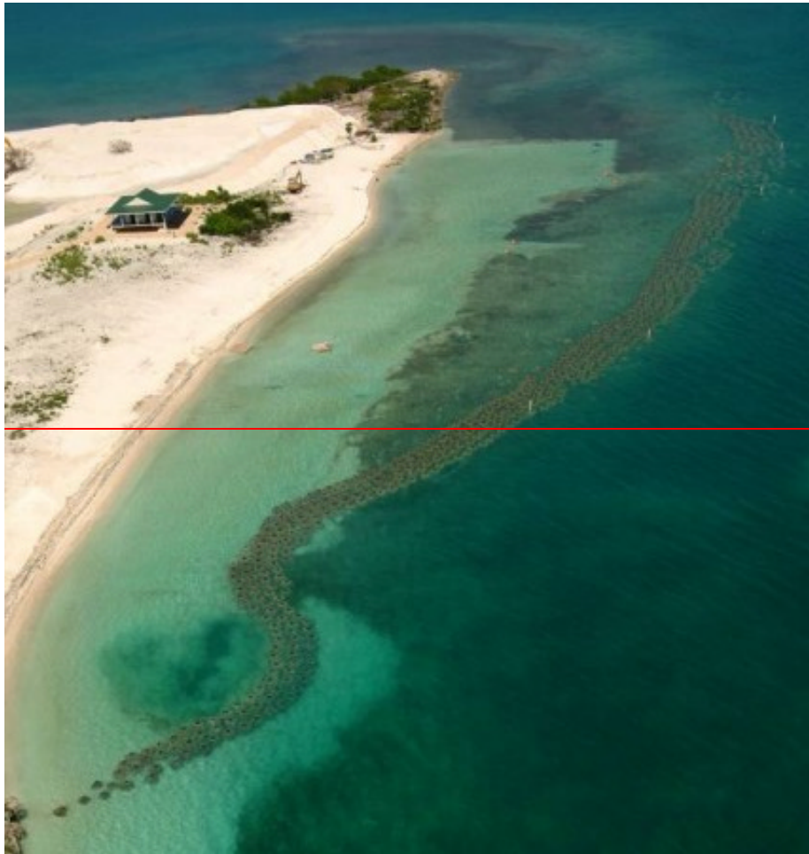
Figure 7 Aerial photo of the Maiden Island, Antigua project.