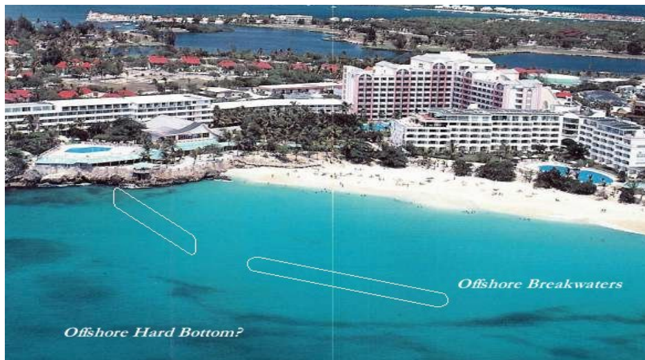
Figure 3 Previous Conditions at Maho Beach with Conceptual Location for Submerged Breakwater System.

While not the primary goal of the Maho Beach Resort and Casino submerged breakwater project, optional features such as coral transplants and snorkeling/diving trails should be considered as secondary goals because of the added value and benefits they represent.