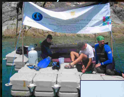
New modular barges configured for coral fragging and plugging (above) and deployment (right.)

Additional molds and the training of new volunteers and labor during the February visit have allowed work to begin on the construction and deployment of the over 300 new Reef Balls to be placed in March of 2005