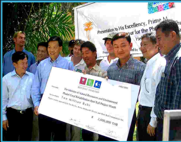
Members of the Reef Ball Foundation, the Racha Resort and Racha Seamaster Divers, present check to His Excellency Prime Minister Thaksin Shinawatra and His Excellency Khun Suwit Khunkitti, Minister of Natural Resources and Environment.

include not only the creation of new reef but the rescue of damaged corals and post-disaster restoration of the reef environment.