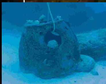
Left - a Reef Ball as it was just deployed in September of 2004. Right - the same ball in February having survived the tsunami intact, and Above Right the coral plugs which also survived.