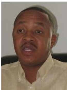
Turks and Caicos Minister of Natural Resource, Fisheries and Environment, McAllister Hanchell

The Ministry of Natural Resources has planned a number of activities in celebration of the Year of the Coral Reef. They include: a public Awareness campaign, the use of literature and the creation of programs aimed at creating awareness of coral reefs and their associated systems such as mangroves and seagrass beds.